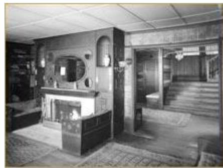
Samuel Tilton House 1881-82, Sunnyside Pl, living room; architect: McKim Mead and White