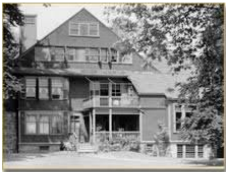
Samuel Tilton House 1881-82, Sunnyside Pl, street facade; architect: McKim Mead and White

For me, the Samuel Tilton House was one of the trip's many highlights. Designed by McKim, Mead, and White and built in 1880-2, the house is a privately-owned residence in the heart of Newport. When we visited, the house was largely unfurnished, which allowed us to experience the interior architecture in a whole new manner. I found the glasswork and the decorative details on the fireplaces, built-in cabinets, and other woodwork to be inspiring.