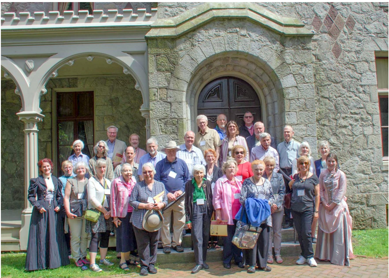
The 2019 VSA Philadelphia Study Tour group included many alumni.