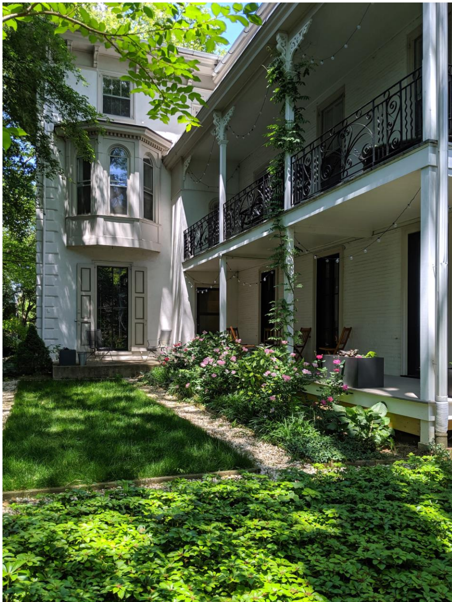
The Alumni Association meeting was held in the garden.

Each of these families witnessed tremendous change in the neighborhood, including urban disinvestment, the rise of the counter culture movement, the expansion of nearby Drexel University and University of Pennsylvania, and the slow pace of gentrification over many decades.