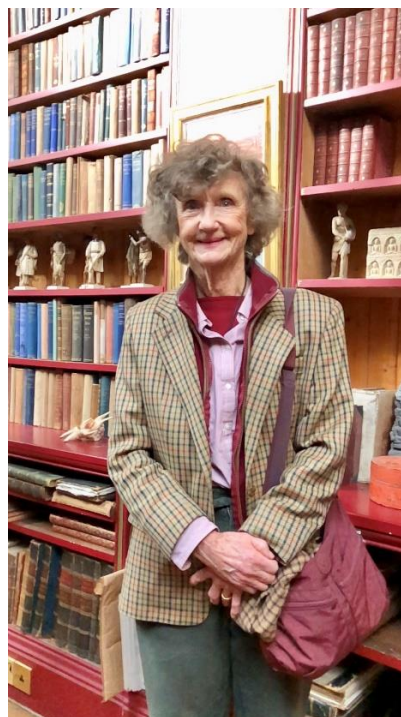
October 2018