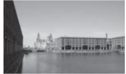
Albert Dock, Liverpool (Jesse Hartley with Philip Hardwick, 1841-46).