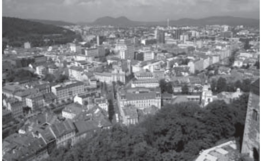
Hilltop view of Ljubljana

Jozef Plecnik (born January 23, 1872 in Ljubljana, Austro-Hungary, now Slovenia, died January 7, 1957 in Ljubljana) was a famous Slovene