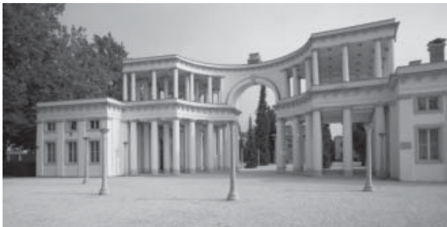
Zale Cemetery on the outskirts of Ljubljana

Ljubljana is a very cosmopolitan city, with very good restaurants and many