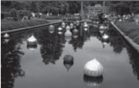
Dale Chihuly exhibit at the Missouri Botanical Gardens, St. Louis, Missouri