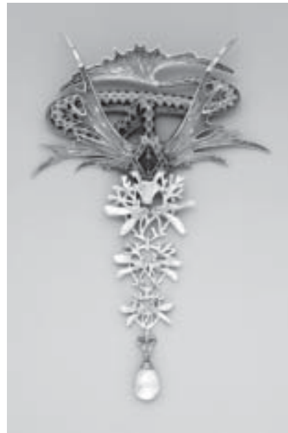
Winged Chimera Brooch