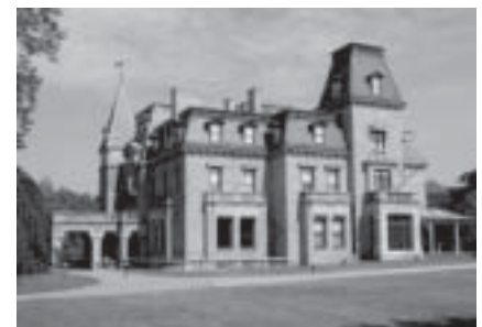
Chateau-Sur-Mer, the Wetmore house. (Seth Bradford, 1854, remodeling Richard Morris Hunt, 1870-80).