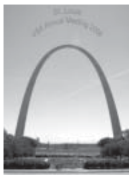
(Left) Cupples House, exterior; (right) St. Louis Arch