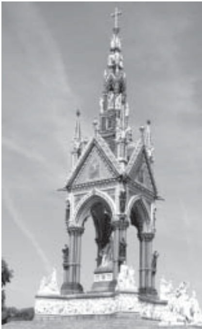
The Albert Memorial. The restoration of this nineteenth century monument to the German-born consort of Queen Victoria is indebted to the Victorian Society and its "Save Albert" campaign.

The study tour exceeded my expectations in every way imaginable. The distinguished faculty members were truly experts in their respective fields. Their lectures were insightful and interesting and provided a unique view