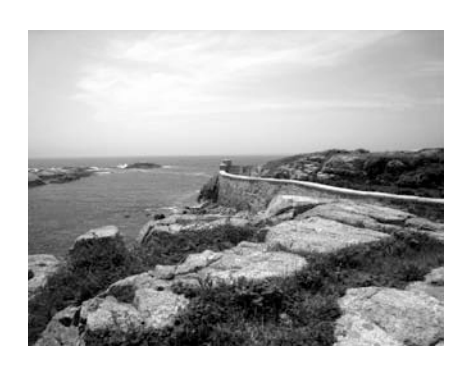
The Newport Cliffwalk.

Our itinerary led us through this history as we balanced lively classroom lectures and discussion with visits to civic and religious sites, museums, private collections, historic homes, the great estates lining Bellevue Avenue, and other buildings maintained by Newport's great preservation and historical societies. We relied on Architectural Tour Notes, our Newport encyclopedia; although most of the course took place in Newport, we also embarked on excursions to other locations, including Providence, Rhode Island, and North Easton, Massachusetts.