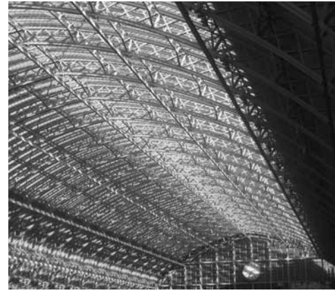
(L to R): Biddulph Grange Gardens. (Photo by Deirdre Pontbriand); The author, Deirdre Pontbriand, relaxing in Oxford. (Photo by Monica Obniski); St. Pancras Station. (Photo by Deirdre Pontbriand)