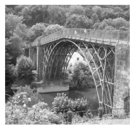
Coalbrookdale Bridge.

A typical day in London started early with a wink from MIC staffer Alexis and a communal eggs-and-bacon-