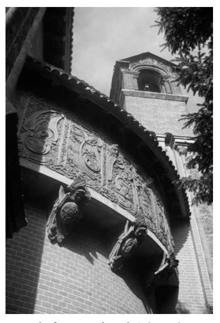
Detail of Watts Chapel.

Despite the fast pace, tea and scones with cream and jam luckily awaited around almost every bend! There was always tea and, thankfully, rest for our weary legs at the Art Workers Guild, where we were engaged by many lectures, including "Artists' Houses," "Great Exhibitions," "The Iron Revolution," and "The Garden City Movement." After pinching pence on Marks & Spencer sandwiches and crisps for lunch, dinner was more often than not had at the MIC, where the price was right for the enticing nightly selections (note: avoid the cake). Highlights of touring in London included an exhilarating ride on the London Eye, the Sir John Soane Museum (if we could have only seen it by candlelight...), the vibrant