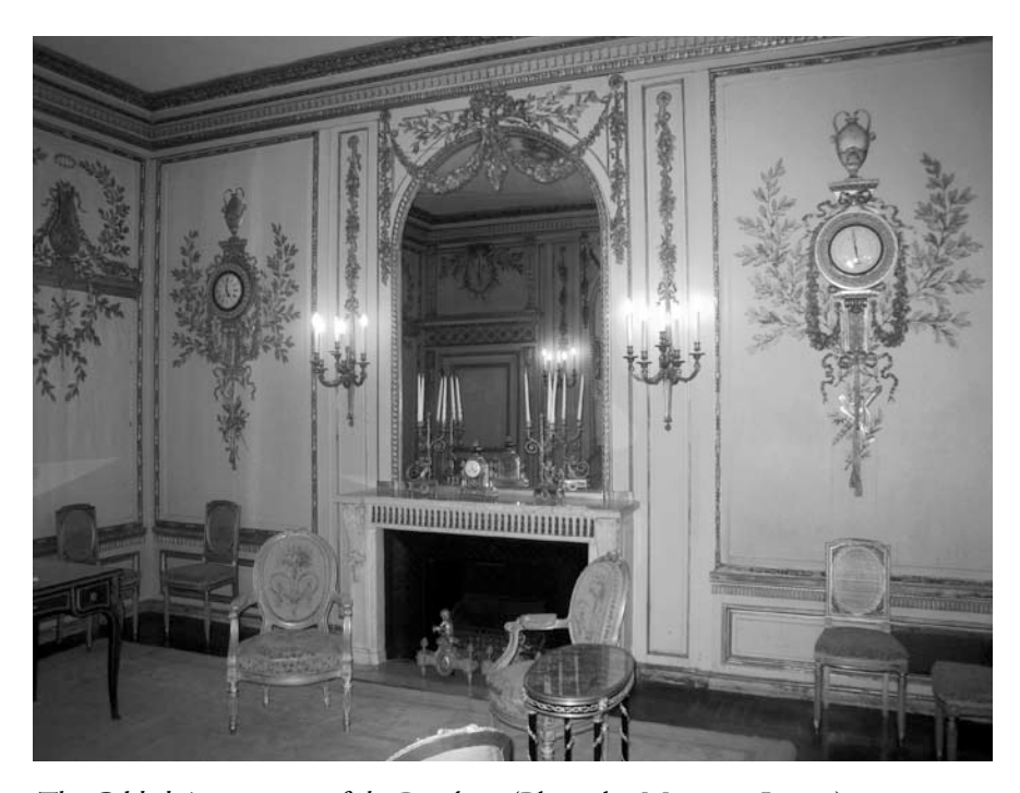
The Gilded Age interior of the Breakers.