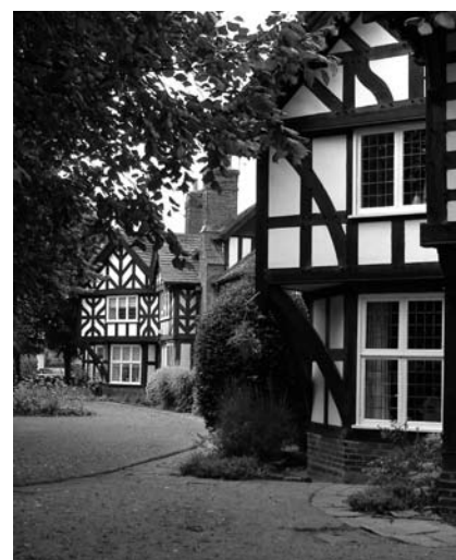
Port Sunlight.

Our final day of the program took us on a day trip to Surrey, where we visited the enchanting gardens of