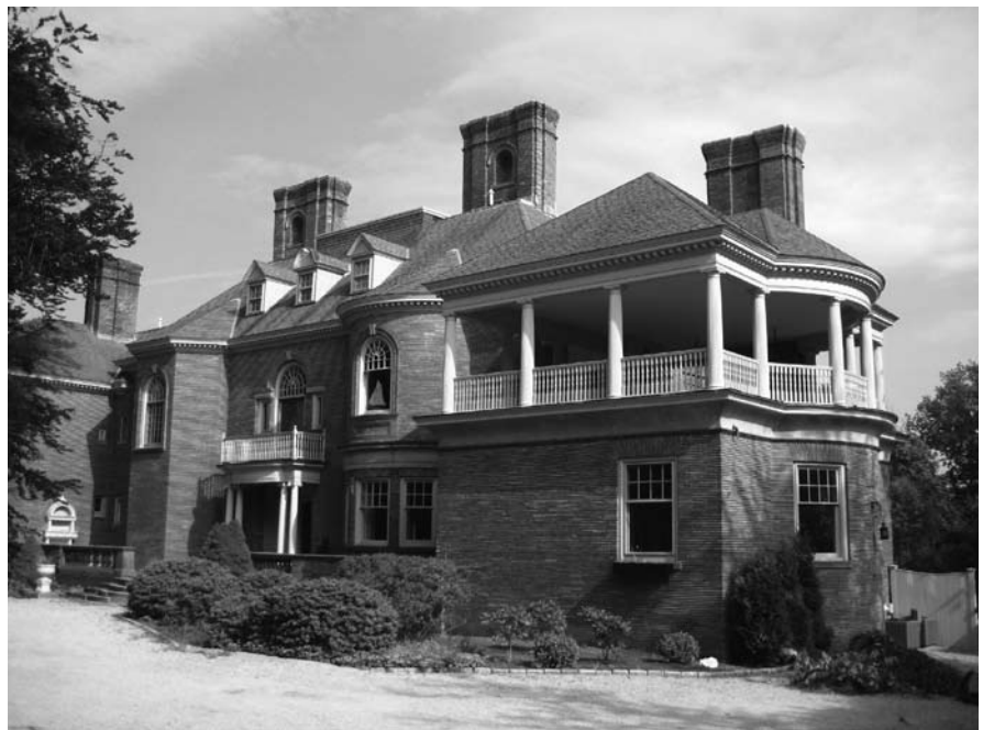
Newport House, McKim, Mead and Bigelow.

After 30 years of vague interest in architectural history, these ten days with the Victorian Society in America Summer School have helped make palpable the scope and range of my future in architectural history like no other course could have. I recommend it to nerds everywhere.