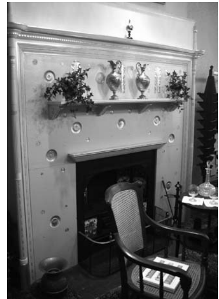
Samuel Tilton house.

Newport, of course, does not exist in isolation, and another theme over the years has been the exploration of the surroundings—farmlands, country estates, or the mill towns that provided the source of the area's wealth. Great examples of Egyptian Revival smoking rooms for the men exist, along with music rooms for the women, and the earliest surviving shopping arcade in the United States can be