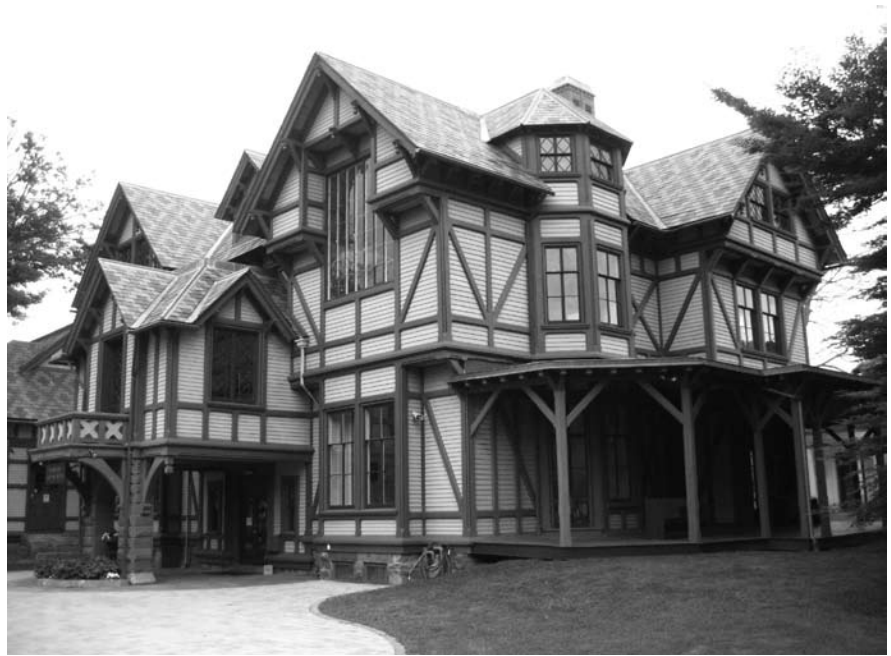
Griswold House, Richard Morris Hunt.