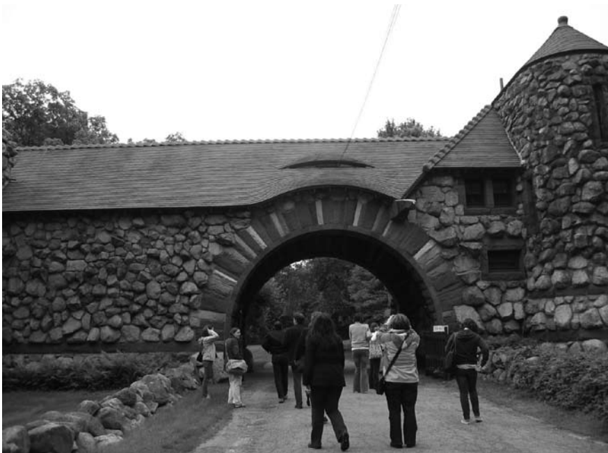
Ames Gate Lodge, Henry Hobson Richardson.

Our minds teeming with new ideas and images, off we went to tour Newport's rich architectural history, beginning with the eighteenth century Trinity Church (1725) and Redwood Library (1747-50) to Hunter House (ca. 1748), where the PSNC had its beginnings, successfully saving this important harborfront home in 1945. The preservation of this early history, largely from benign neglect in the