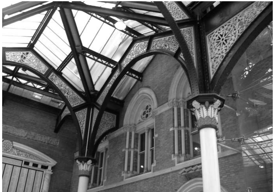
Liverpool Street Station.

Our first full day of the program was typical of the trip overall—busy from start to finish, with a well-organized schedule that took us all over the city and beyond! That morning, like many others, started over coffee, tea, and the expansive breakfast spread at the MIC cafeteria. We spent the time getting to