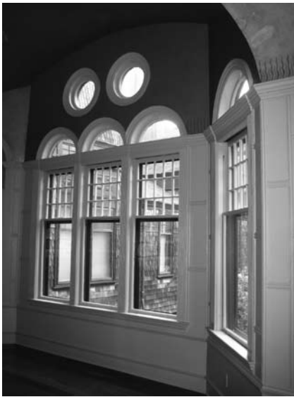
Casino, McKim, Mead and White.

I came late to scholarship. I realized four years ago that I should try to fathom why I had hundreds of photographs and sketches of houses. So I took up the study of architectural history, focusing on the invention of balloon framing and its subsequent influence on house forms.