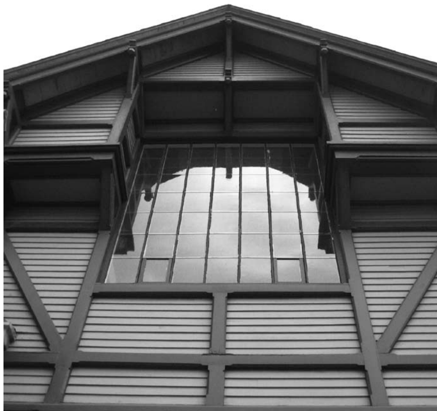
Griswold House, Richard Morris Hunt.