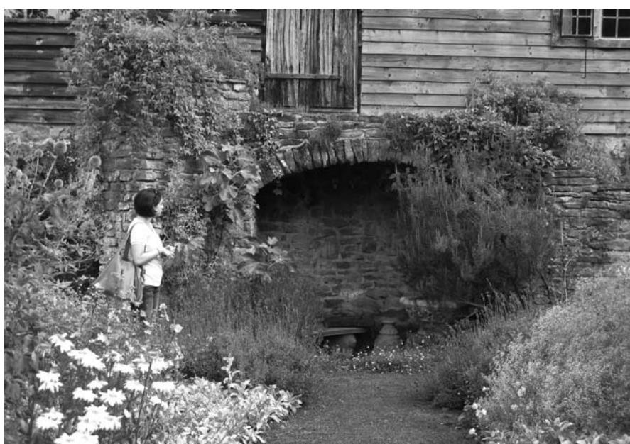
Munstead Wood.